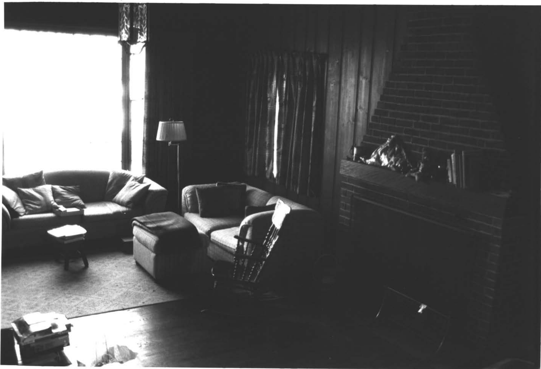
Whipple-Angell-Bennett House Providence County, R.I. Photo # 8 of 8