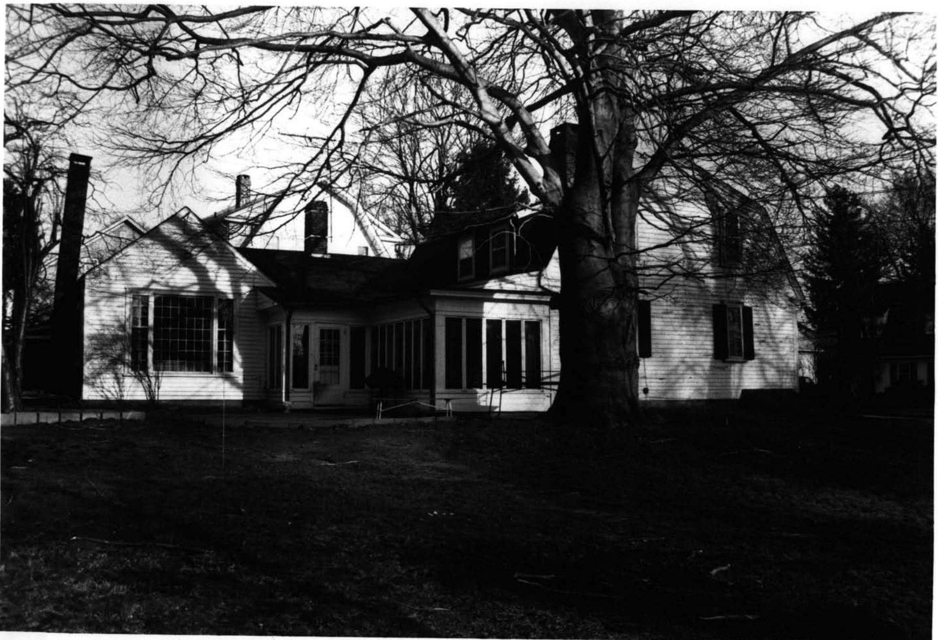
Whipple-Angell-Bennett House Providence County, R.I. Photo #3 of 8