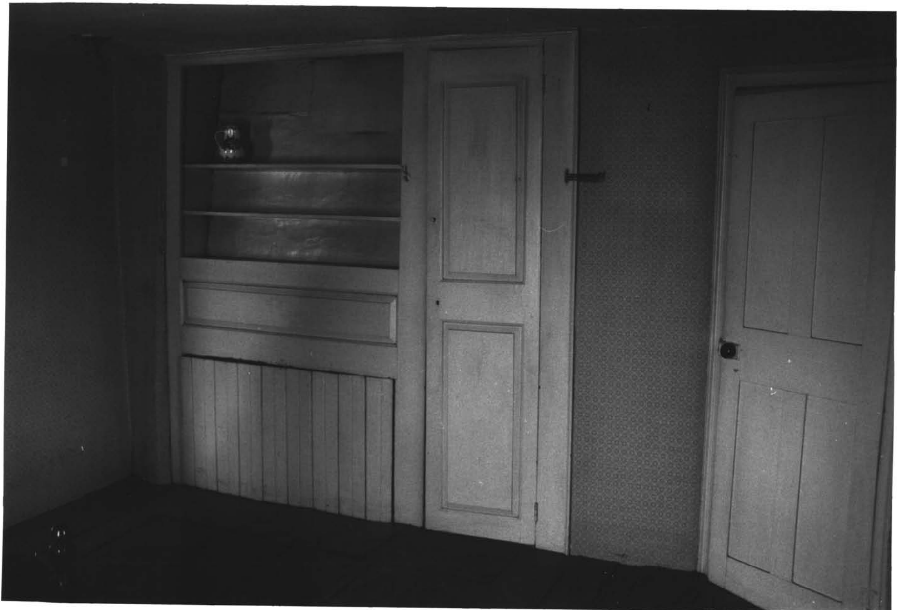
Whipple-Angell-Bennett House Providence County, R.I. Photo # 7 of 9