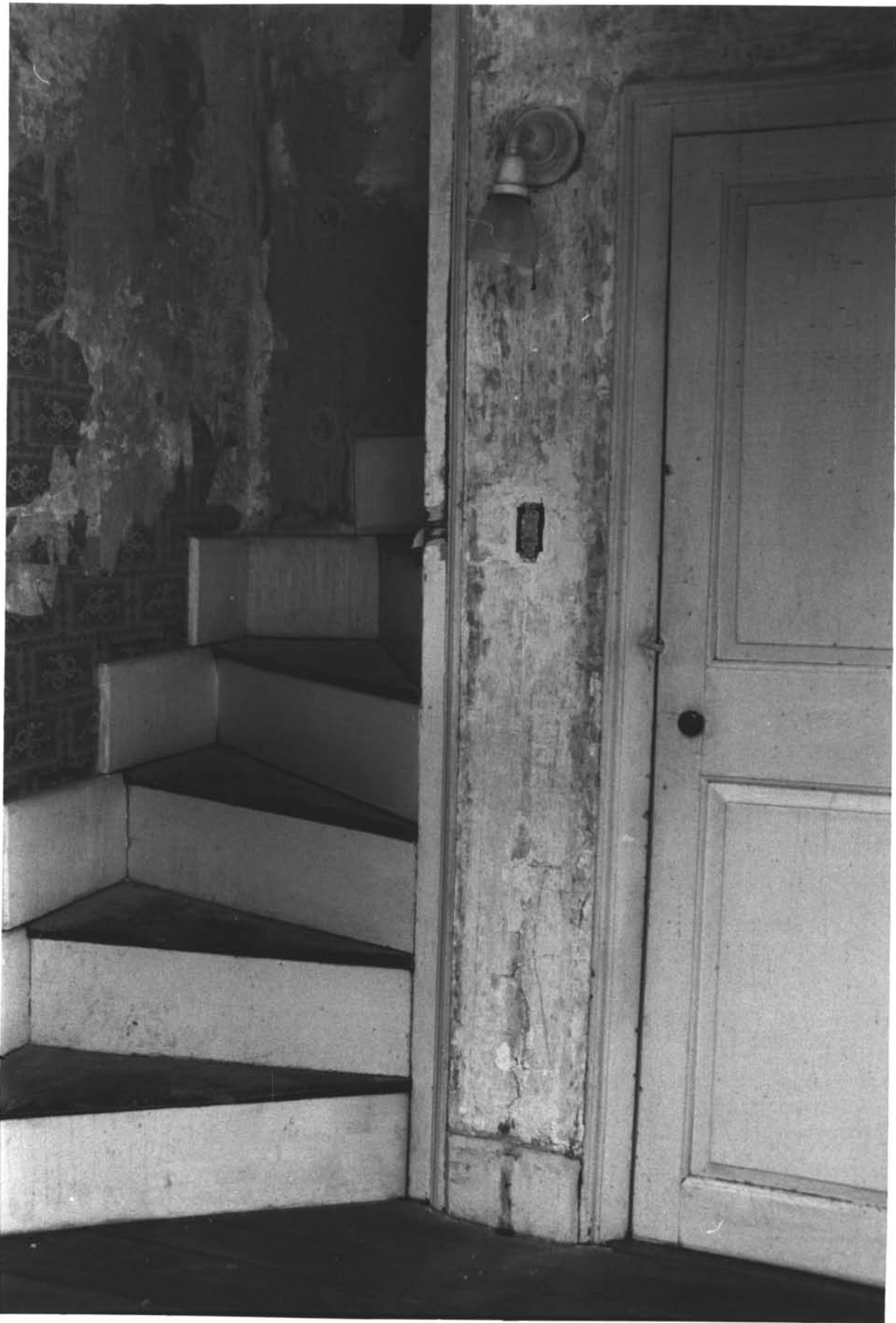
Whipple-Angell-Bennett House Providence County, R.I. Photo #4 of 8