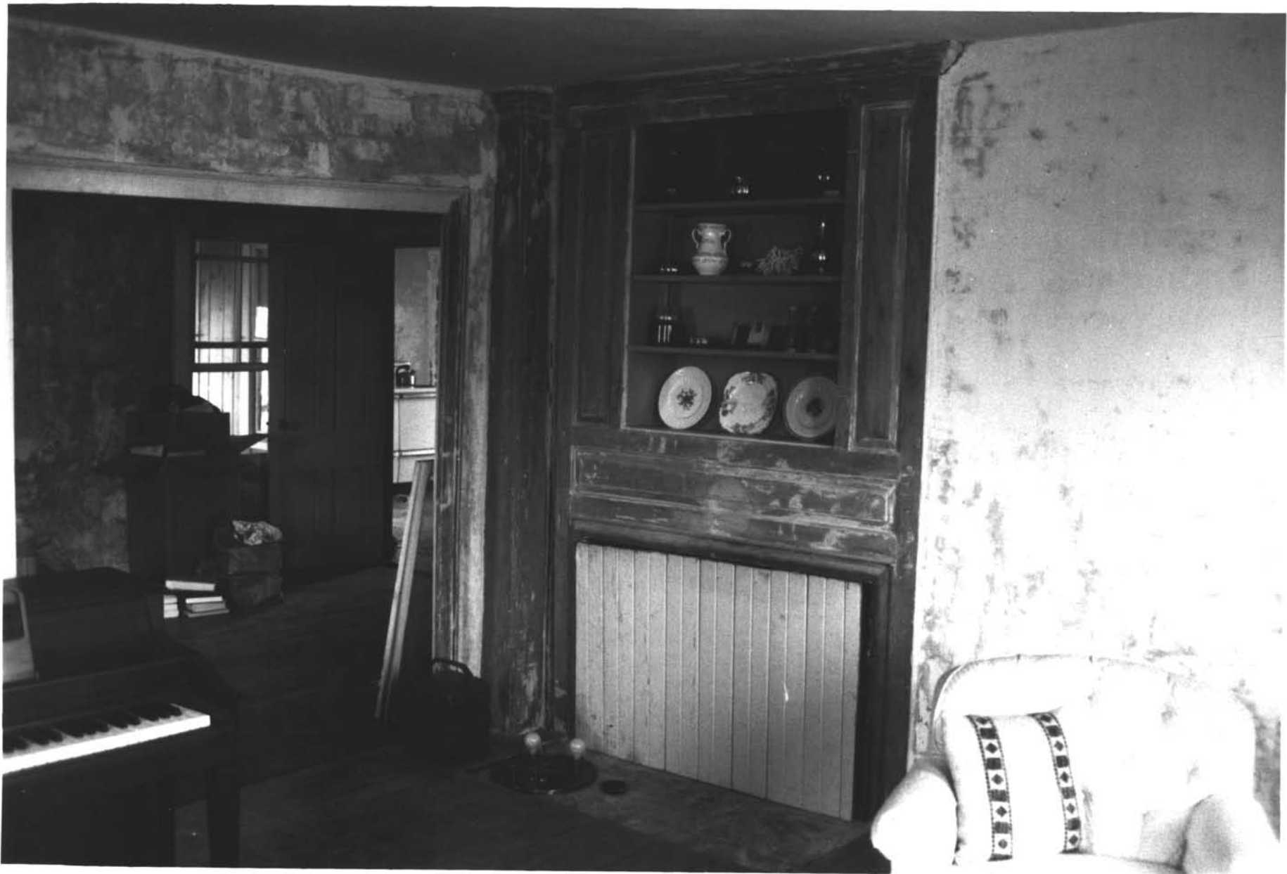
Whipple-Angell-Bennett House Providence County, R.I.