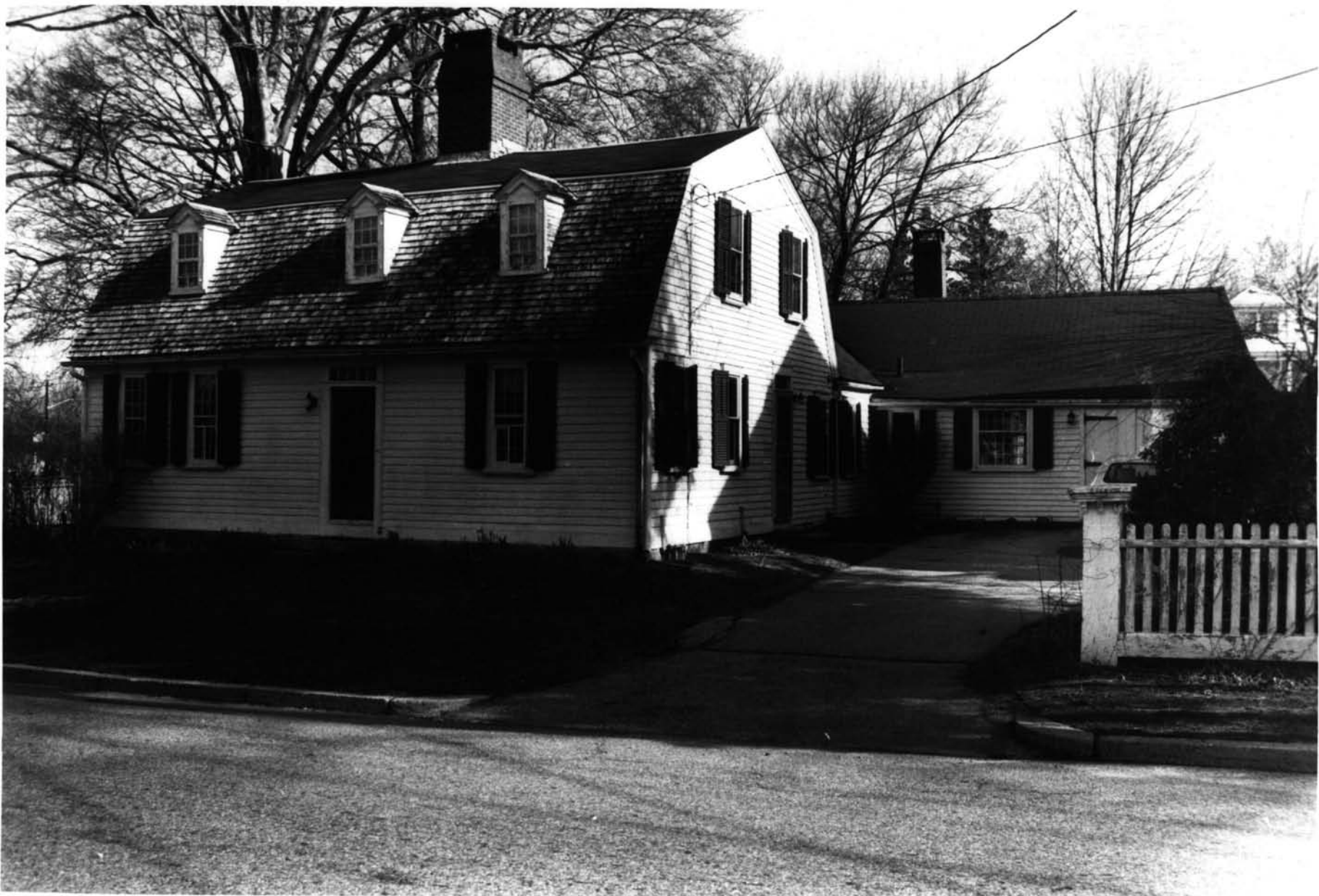
Whipple-Angell-Bennett House Providence County, R.I. Photo #2 of 8