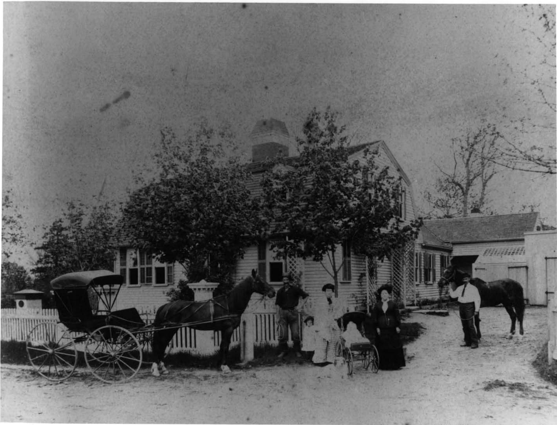
Whipple-Angell-Bennett House Providence County R.I. Photo # 1079