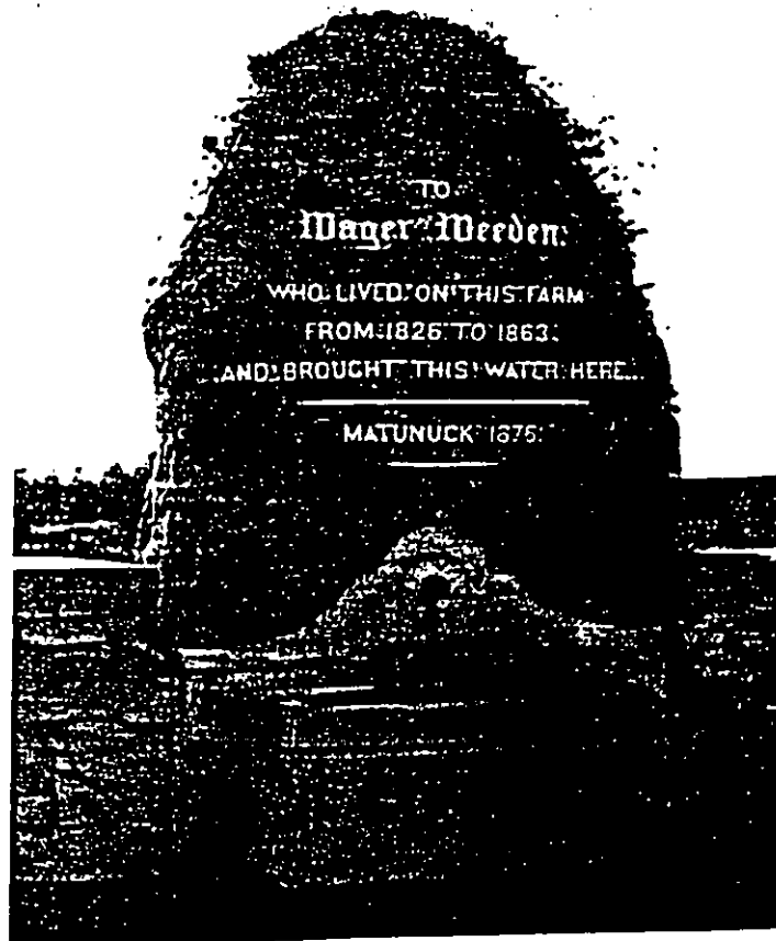
The Weeden Memorial Fountain at Matunuck