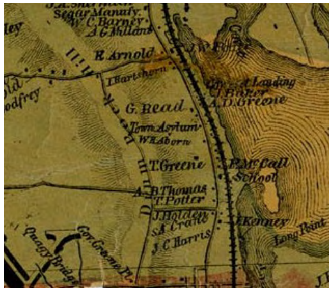
Figure 3: Eastern Cowesett in 1862 (detail).