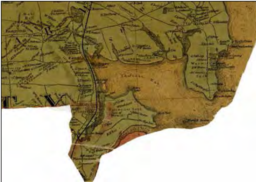
Figure 1: "Cowesett" or Greenwich Bay, with Potowomut on the south, Cowesett on the west, and Warwick Neck on the north and east. (1862)